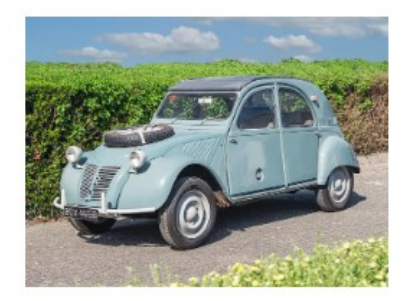
138 — Believed 1 of only 5 assembled in Brussels by Citroën Belgium 1964 Citroën 2CV 'Sahara' AZ 4x4

WOW ! Any Escargots responsible for this !