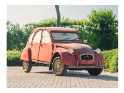
137 — Only 16 kilometres from new