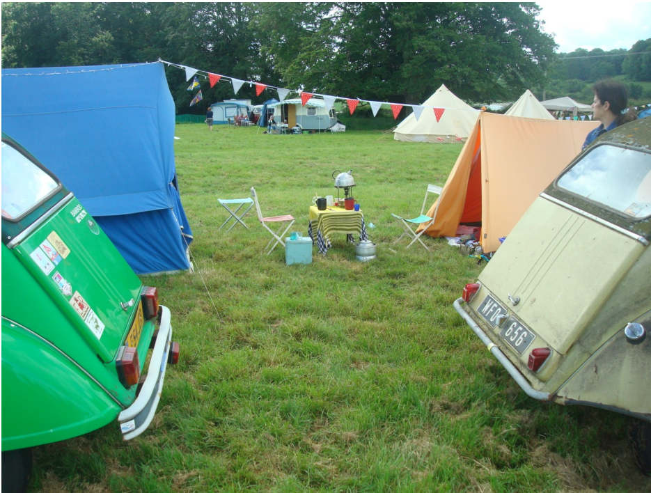
Vintage Nostalgia Festival June 2017

Pam and John have been to something called the Vintage Nostalgia festival near Salisbury, camping in the 'vintage camping field' amongst scores of microbus and classic caravans. John says " some lovely people drive these machines and were very encouraging/ curious/ sympathetic to the 2cv. In the last hour of the Flea market, I bought a big Iron Bed :) , which we discovered would only fit into the 2CV with roof rolled back sticking out of the top , 'Antiques roadshow' style " (nice one you both look great — Ed )